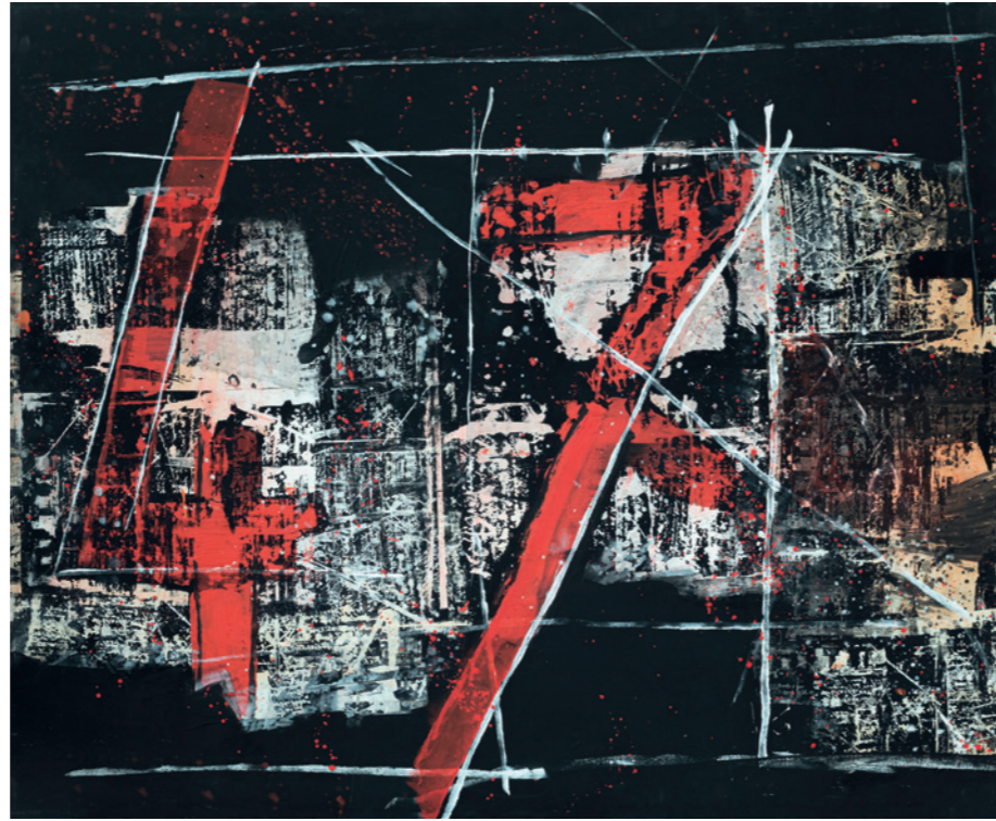
47, 1995 / tempera on canvas / 140x170,5 cm.