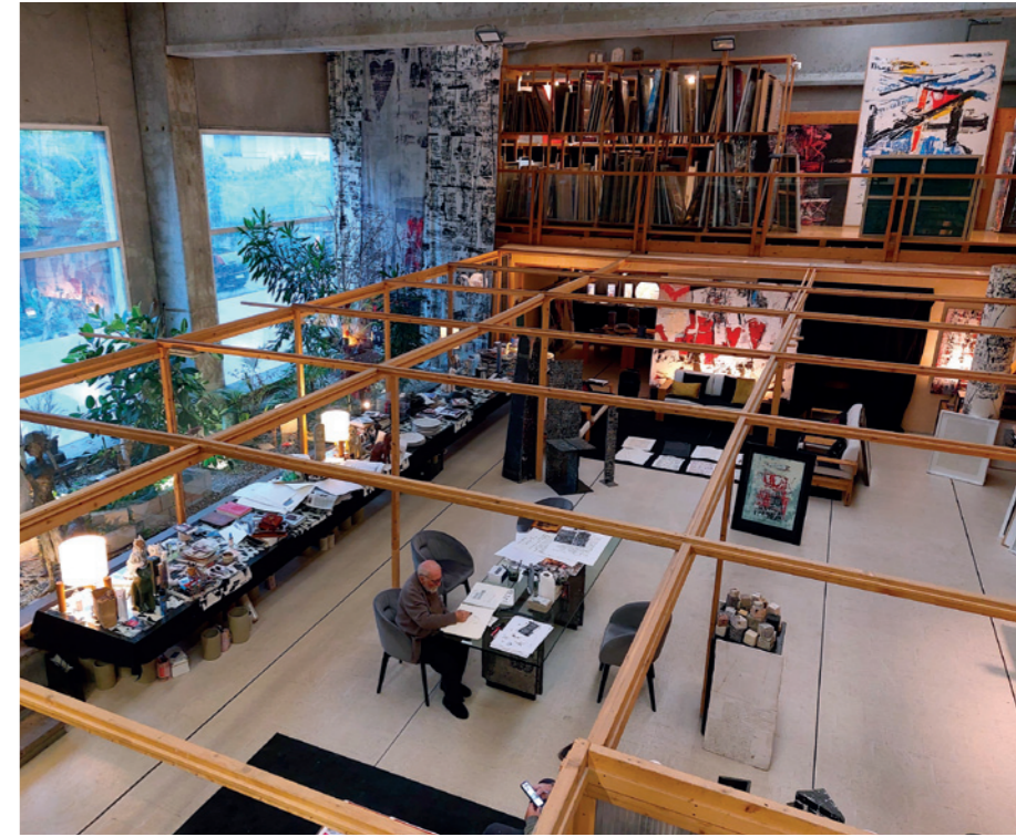
The artist in his studio in Udine, 2024