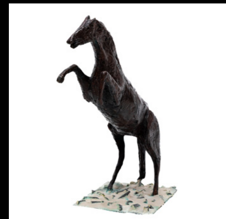
Horse, 1987 / bronze / 70x54x16 cm.

An unstoppable drive for experimentation defines his approach, exploring diverse media from painting to sculpture, ceramics to fresco and engraving. His visit to Terezin in 1965 marked a significant turning point in